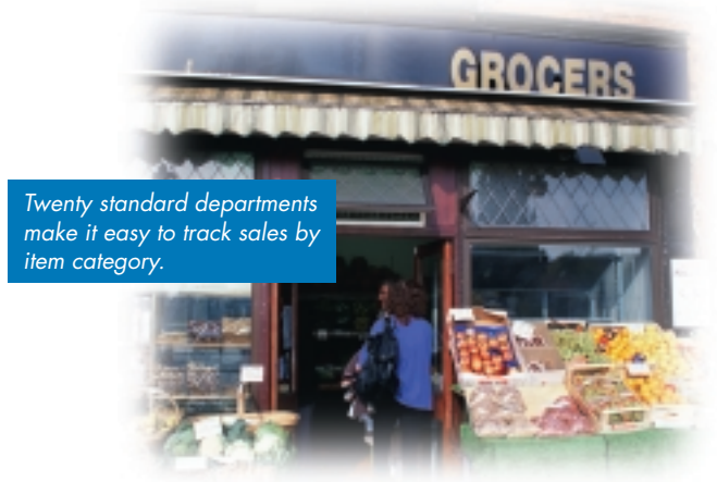
Twenty standard departments make it easy to track sales by item category.

The Sharp ER-A440 can also accommodate an additional cash drawer (for a total of two) and 99 coded cashiers, so multiple employees can operate the same register without any loss of accountability. A food stamp capability provides an audit trail for food stamps tendered. Age verification allows you to monitor sales of age-restricted items for compliance with federal, state and local regulations. In addition, single line validation allows the operator to mark documents such as checks and gift certificates with time and date information – for better record keeping and security.