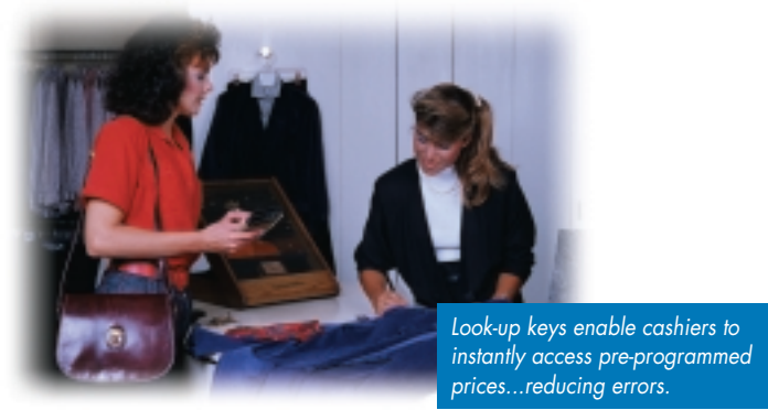
Look-up keys enable cashiers to instantly access pre-programmed prices...reducing errors.